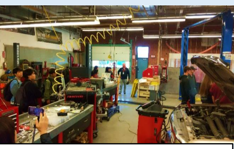
Car technology class seems fun!

The park was established in 1872 and widely considered to be the first national park in the world. It is known for its diverse ecosystems, geothermal features, and abundant wildlife.