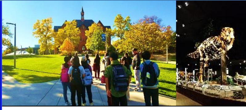
We visited Montana State University, where there was a professor who served as the inspiration for the dinosaur expert Dr. Alan Grant, the main character in the movie 'Jurassic Park.'