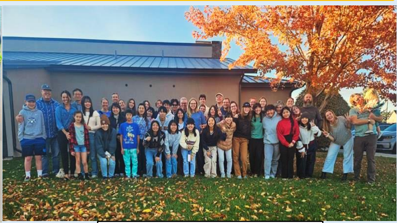
At the farewell party with the host family.