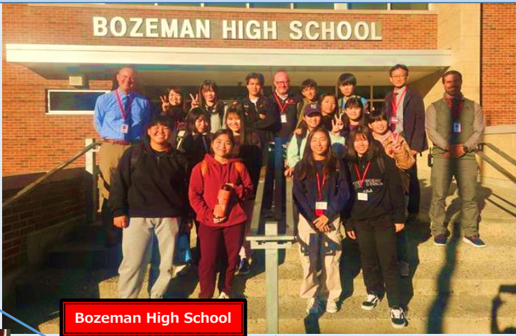
Bozeman High School

The city of Bozeman, Montana with a population of 54,000 (Yomitan Village, by the way, has 42,000), is known for its beautiful Rocky Mountain scenery and a wide range of outdoor activities. Furthermore, Montana State University is located in the city, which adds to its appeal for both residents and visitors due to its mix of natural, cultural, and economic factors.