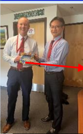
We presented a shield in commemoration of the first exchange.