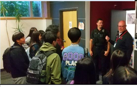
At the school, a police officer is on duty, and of course, he carries a handgun for emergencies.

Our school's exchange program with Bozeman High School, with which we established a sister school partnership in 2020, has finally been successful after a three-year delay. Even with COVID-19 difficulties, we had on line exchanges before. However, this time, a group of 14 students were able to participate in the exchange, and they gained valuable experiences by spending time with host families and teachers.